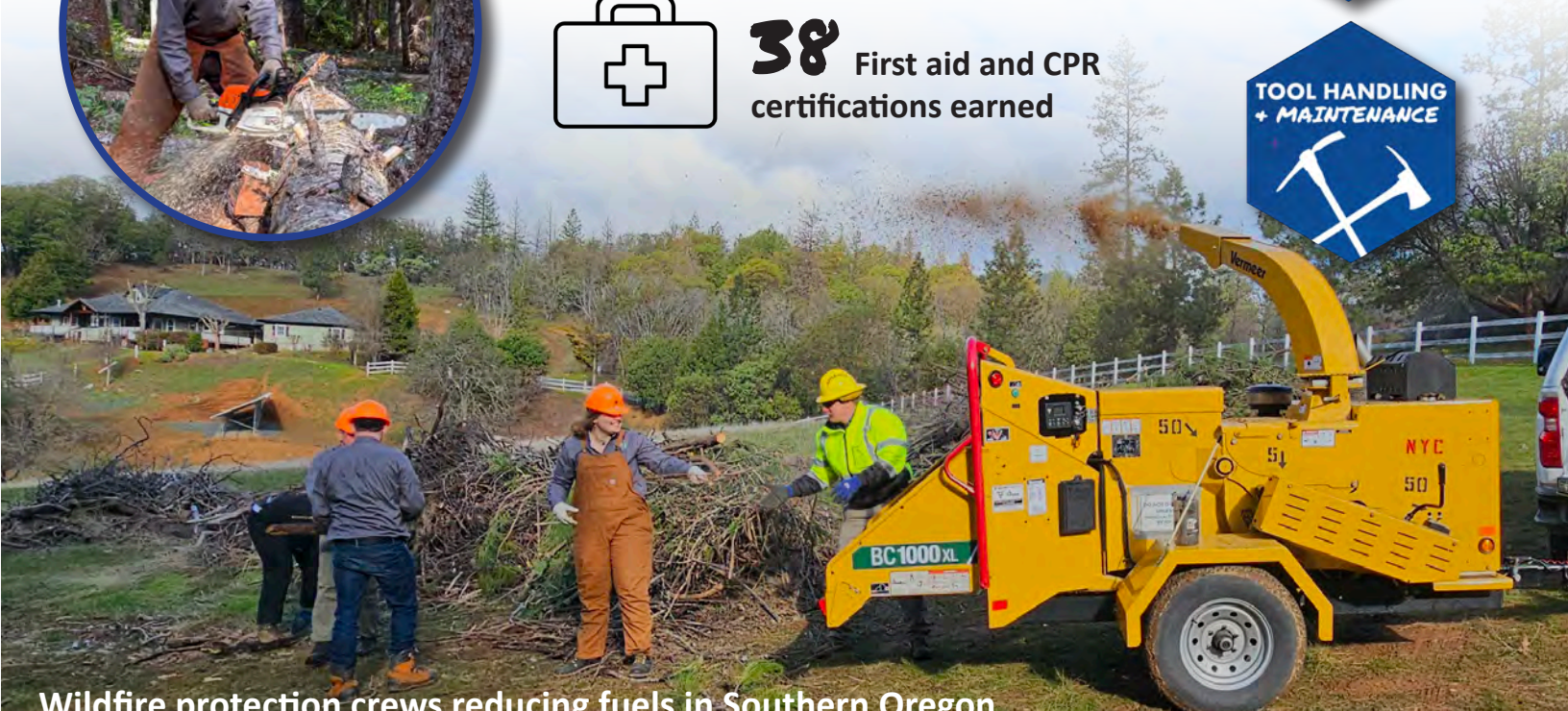
Wildfire protection crews reducing fuels in Southern Oregon