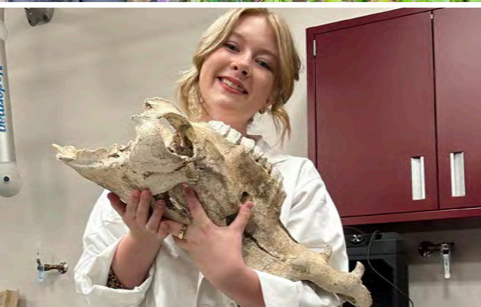
Intern serving at Hagerman Fossil Beds National Monument