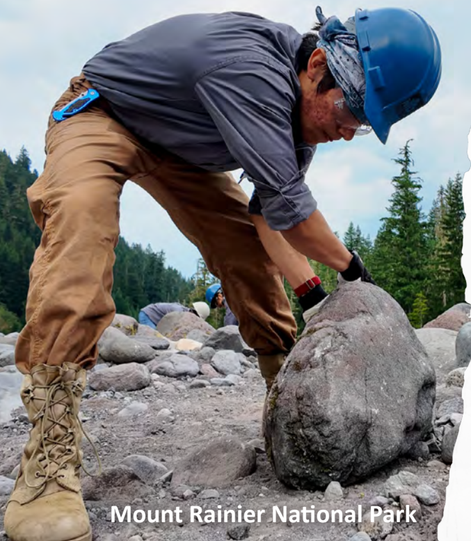
Mount Rainier National Park

“This summer has been one of the most formative experiences and has jumpstarted my passion for a career in the environmental field. Throughout this program I have learned the great importance of protecting and preserving our public lands, and it’s through programs like NYC that get youth engaged in conservation that will help keep this country beautiful for generations.”