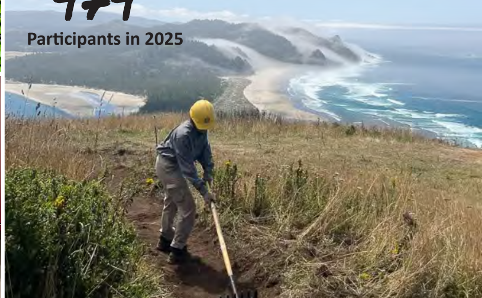
Cascade Head Preserve near Lincoln City, Oregon