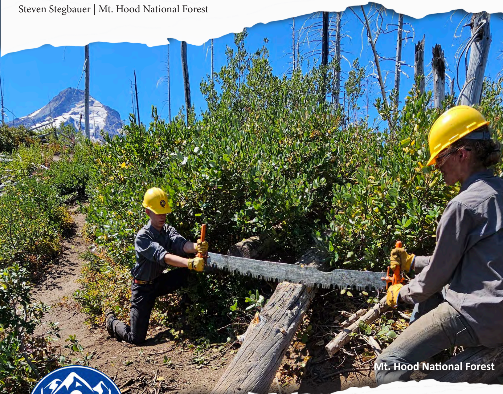
Mt. Hood National Forest

Steven Stegbauer | Mt. Hood National Forest